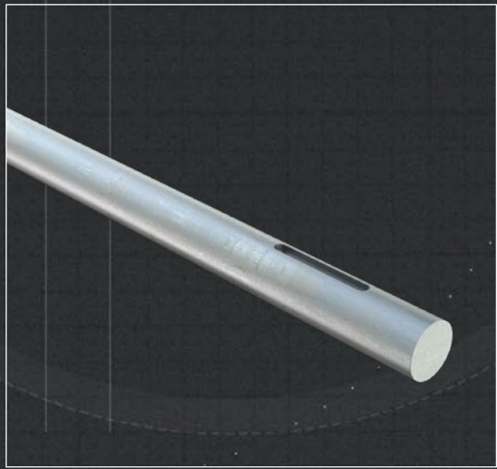
CUSTOM TAIL SHAFT

Bored keyway head with no turn down machining.